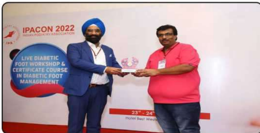
Diabetic Footcare Workshop, Hyderabad, 23rd & 24th July 2022